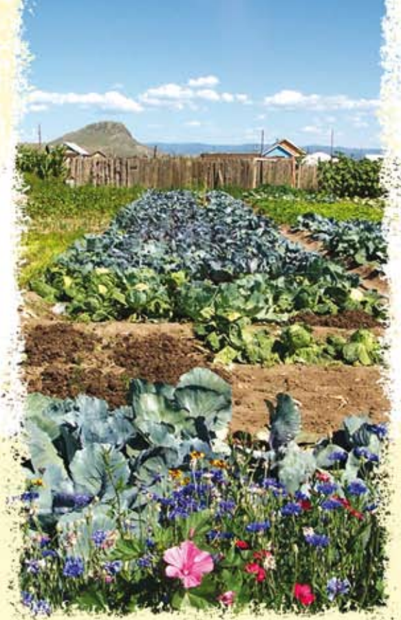
Imagine the benefits an agribusiness could bring...

In summary, we are committed to Business as Mission in a dignified, credible, and sensitive manner so that the church of Christ might be established and strengthened for His glory. ☺